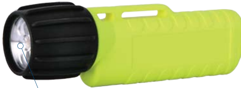
Advanced Compound Path Optics