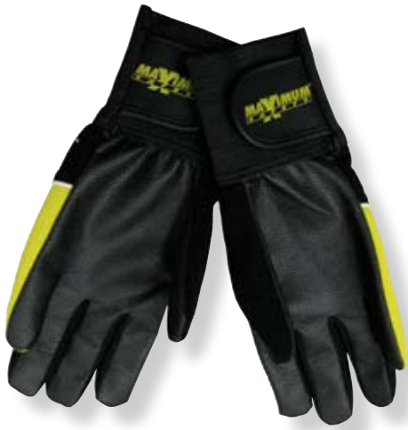
Rope Rescue Gloves