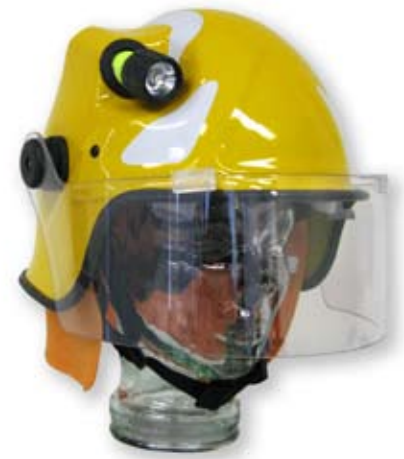
F10TCV Structural Helmet with inbuilt torch – Certified to AS 4067

Fire & Safety WA Unit 2 / 63 Furniss Road Landsdale WA 6065 www.fireandsafetywa.com.au