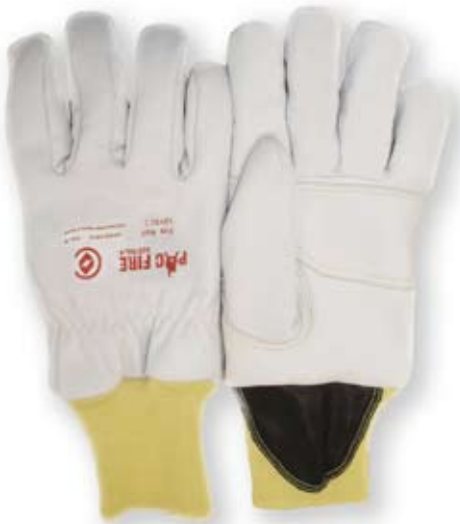
Firewall 2 Structural Fire Glove