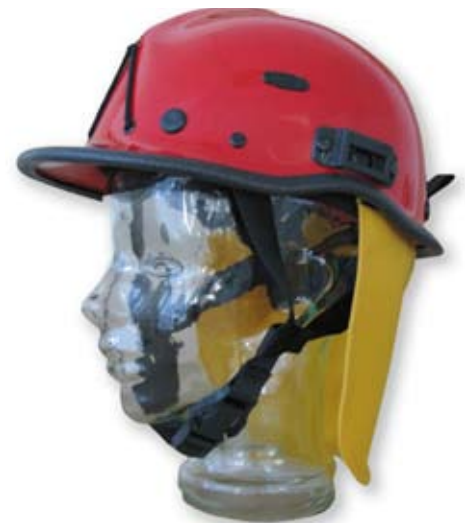
R5 Rescue Helmet – Certified to AS 1801 Type 2