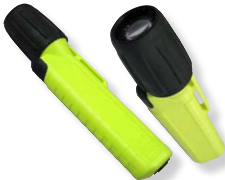
LED Zoom Torch