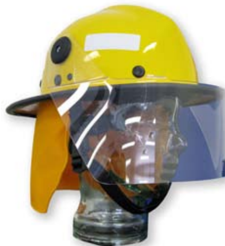
BR5F Bushbud Wildfire Helmet – Certified to AS 1801 Type 3