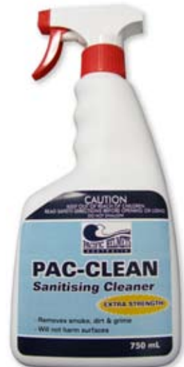
Helmet Cleaner / Sanitiser