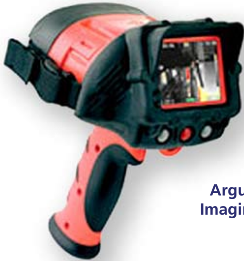
Argus Thermal Imaging Cameras