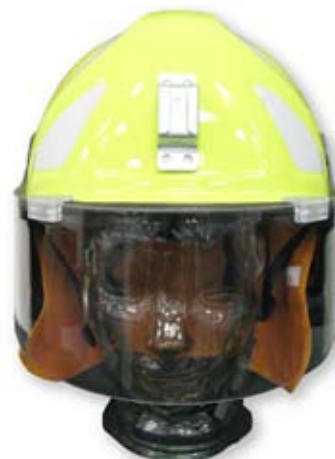
F10 Structural Helmet – Certified to AS 4067