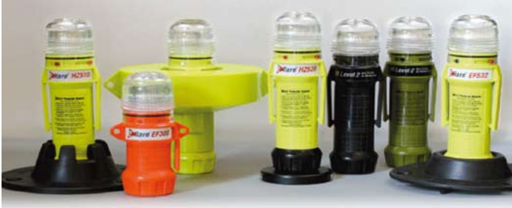
Eflare's Safety Beacon Range