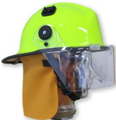
F3 Structural Helmet – Certified to AS 4067