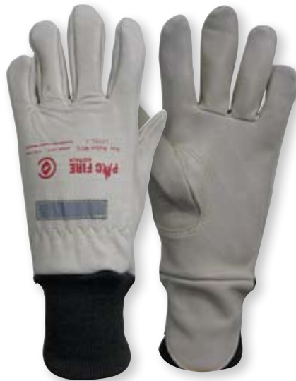
Firewalker Level 1 Gloves