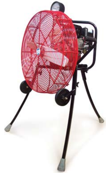
Ventry PPV Fans