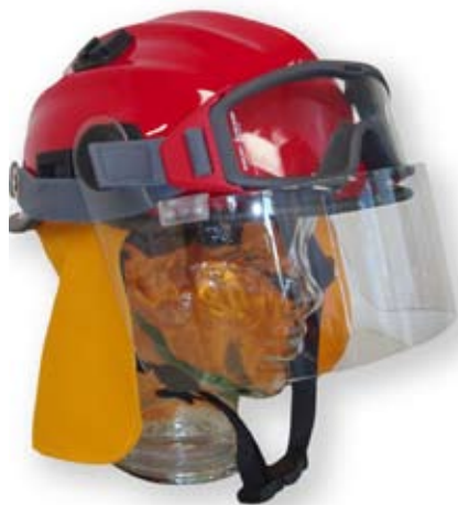
BR9 Multipurpose Bushfire / Landcare Helmet – Certified to AS 1801 Type 3