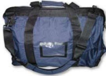
Medium Gear Stow Bag