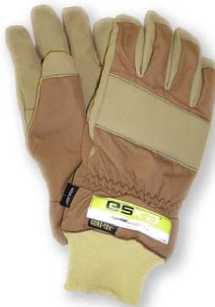
Jupiter 2 Structural Fire Glove