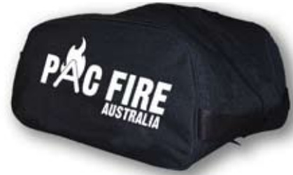
Helmet Carry Bag