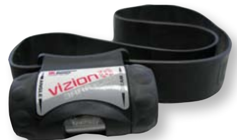
eLED Headlamp Torch