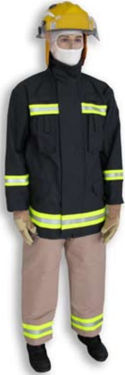
Wessex and Ergotech Clothing by Bristol