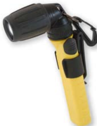
4AA Right Angle Torch