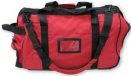
Gear Stow Bag with wheels