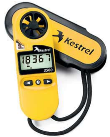
Kestrel Weather Meters