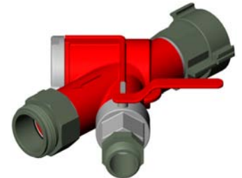
2 WAY BALL VALVE with anti-return valve