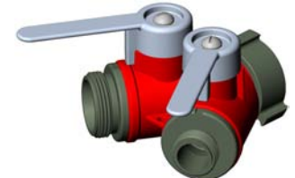
BIPOK WILDLAND *Available Long or Short Handle