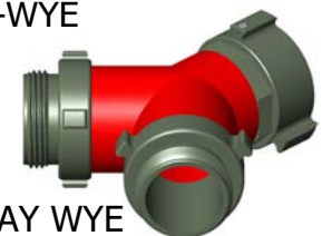
3 WAY WYE