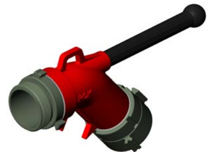
Anti-Recoil DIN 14-368 - 2.5"