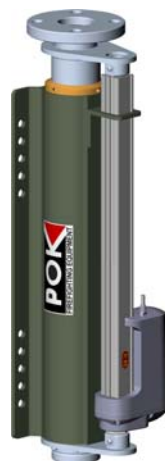
Electric Telescopic Tube