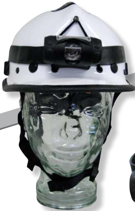
Removable LED Lamp Module For Use As Work Light