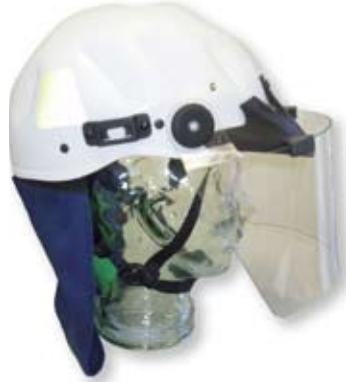
Optional neck flap and visor shown above